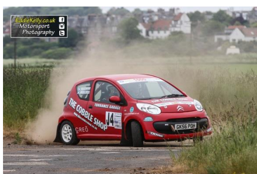
Andrew – a big drift!!