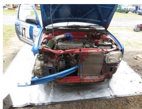
Fraser – you should see the tyre!!